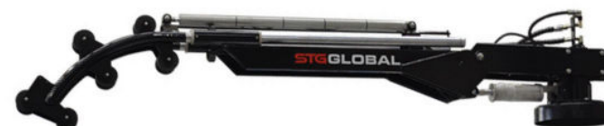
STG GLOBAL SUCTION BOOM